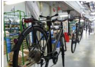
E-bike sales in Germany increased by a big 19 percent in 2017. However, the volume of the total bicycle market was down 5 percent.

BERLIN, Germany – The e-bike market in Germany is growing at record pace. The newest 2017 data from industry association 'Zweirad-Industrie-Verband' (ZIV) clearly underlines that e-bikes nowadays in Germany are, next to a preferred mode of mobility as well as for leisure and sports, also a clean, quiet and space-saving alternative for city logistics.