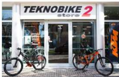
2017 e-bike market growth stood for Italy at 19% and for UK at about 20%.

DOETINCHEM, the Netherlands – It's now perfectly clear. The growth in sales of electric bikes which in particular has taken place in the Netherlands and Germany is being followed-up in all European markets. And especially in the most important West European markets for bicycles. After France showed a remarkable e-bike sales growth in 2017, the same holds true for Italy and the UK. With that electric bikes are turning into a major Europe wide trend.